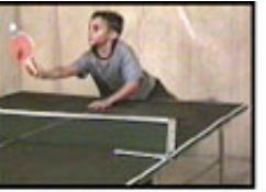
Right hand aims while left stabilizes