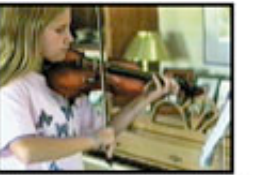
More manipulation skill in non-dominant hand