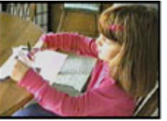
Each hand performs differently