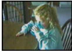
Unilateral use of cup