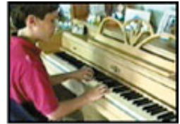
Each hand performs differently