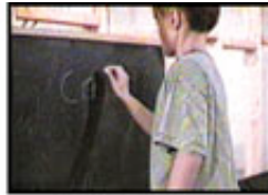
Unilateral use of chalk