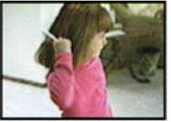
Right hand use of comb for right side