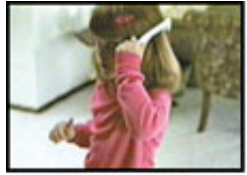
Left hand use of comb for left side