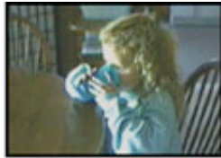
Both hands used symmetrically