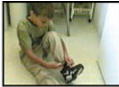
Each hand performs differently